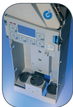
Payout module offers 3 independent & parallel working motors. Pays out up to 6 coins per second. Built-in redundancy in case one motor fails, 4 tubes are still available.